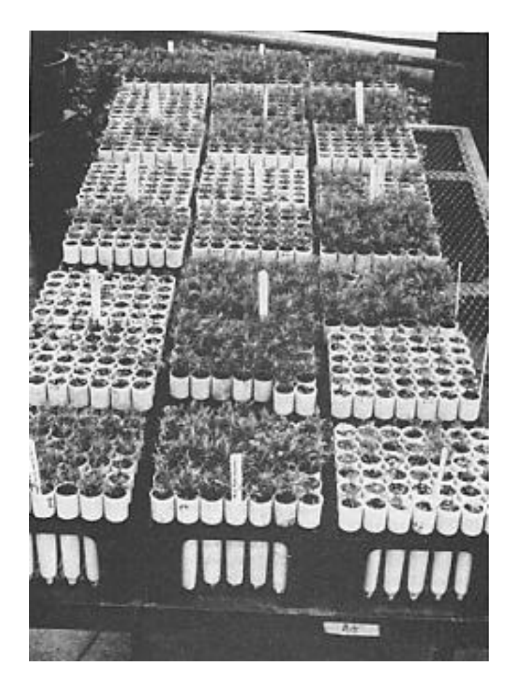
Figure 2 - Early operational trials with a variety of different container and growing media treatments showed that heat sterilization greatly reduced the number of symptomatic seedlings.

The 1985 sterilization trials revealed that, although the steam sterilization treatment gave poor results, both the autoclaved growing media and the MBC-2 fumigation greatly reduced or even