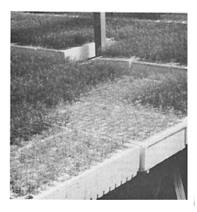
Figure 1 - The "block effect", in which disease symptoms are restricted to seedlings in certain used containers, is thought to be related to soilborne pathogens which are transmitted on particles of growing media or root pieces that remain in the container between crops.

Based on these promising initial trials, two different methods of heat sterilization of the growing media were tested during the 1985 growing season. One batch of growing media was again autoclaved, and another treatment consisted the standard horticultural practice of steam sterilizing growing media, which was contracted to a local ornamental nursery. The steam sterilization contract specified that the growing media bheld at a temperature of 200 °F (94 °Č) for 30 minutes, instead of the normal heat pasteurization treatment which consists of temperatures of only 140 to 177 °F (60 to 82 °C) for the same time period. Following these heat treatments, the growing media was loaded into containers, and sown in the normal manner. A third growing media sterilization treatment with methyl bromide fumigation was added to further test the soilborne pathogen hypothesis. In this treatment, containers were filled with peat-vermiculite growing media and then fumigated with 98% methyl bromide/2% chloropicrin (MBC-2). At the end of the specified aeration period these filled containers were sown and placed in the greenhouse, and the seedlings were grown under normal nursery culture.