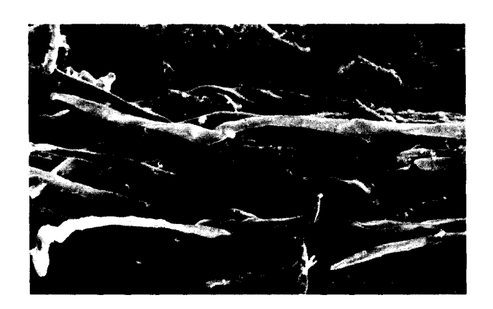
Figure 2.--Micrographs of root hair development in a healthy Douglas-fir germinant.

In contrast, eight-week--old seedlings transplanted