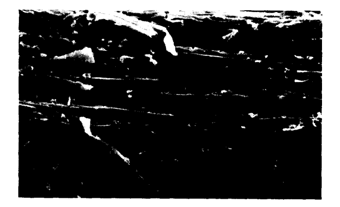
Figure 3.--Micrographs of root hair development in a dieback Douglas-fir germinant.

Figure 2.--Micrographs of root hair development in a healthy Douglas-fir germinant.