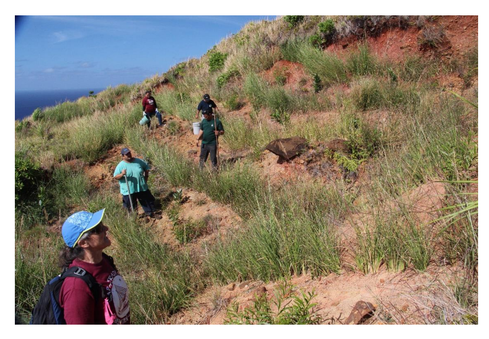
Figure 4. Planting Acacia confusa and vetiver grass on an eroded Oxisol on the island of Rota, Commonwealth of the Northern Marianas Islands.

The Rota site was on a badly eroded slope on the Talakhaya badlands in a location called Asonan (14°7′26.364″ N, 145°12′6.12″ E, 195 m asl) (Figure 4).