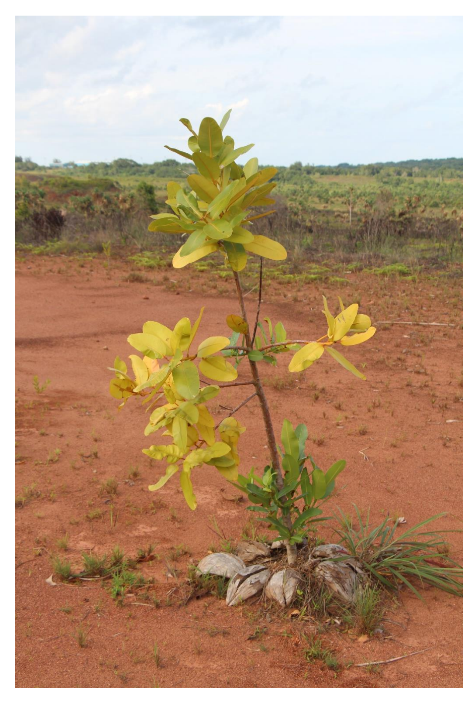
Figure 3. Chlorotic Calophyllum inophyllum seedling in an Oxisol on Yap, Federated States of Micronesia.

also yields valuable timber, and other native species used locally for both food and timber. While the Yap program is more community-focused [27], each island is small enough that many workers on the reforestation projects also live in adjacent communities and have a stake in their success.