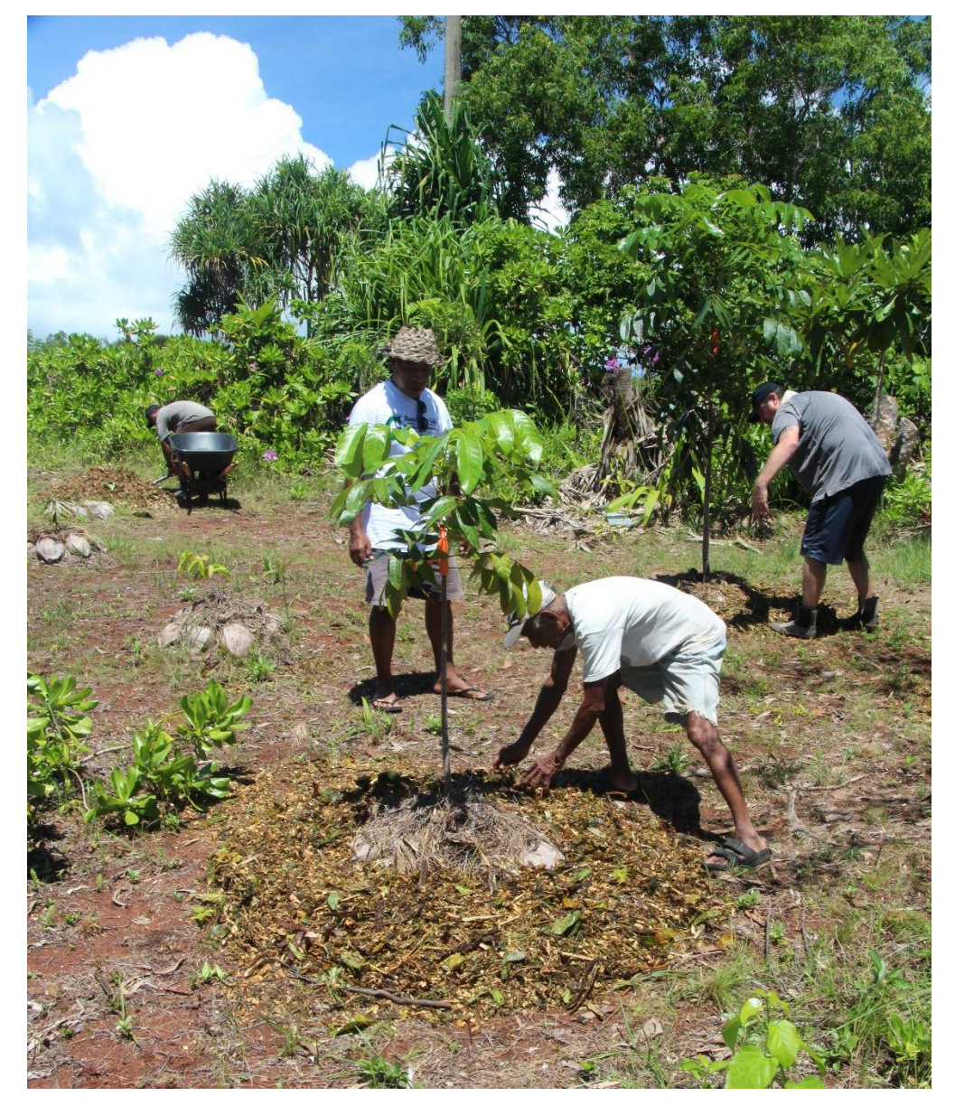
Figure 6. Fresh wood chip mulch applied to Swietenia macrophylla seedlings on Yap, Federated States of Micronesia.

For the second trial, both the Yap foresters and the local community wanted to test the traditional method of mulching with fresh organic matter. A layer of mulch made with freshly chipped branches and leaves of the local native shrub Hibiscus tiliaceus L. approximately 10 cm thick was applied in a ring around experimental trees to a radius of 80 cm (Figure 6).