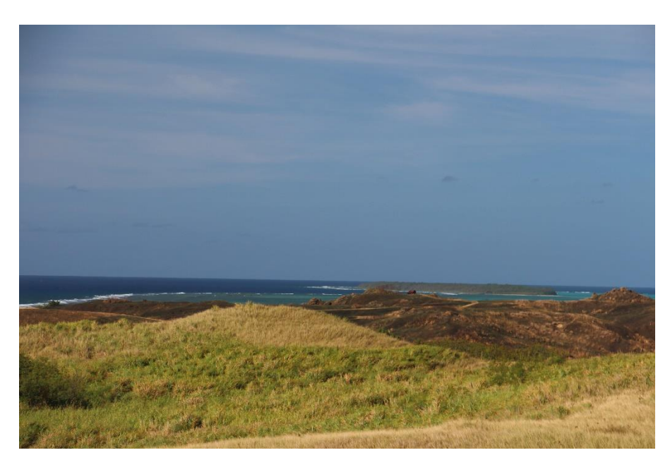
Figure 2. Grasslands of southern Guam showing coral reefs downslope from burned areas.