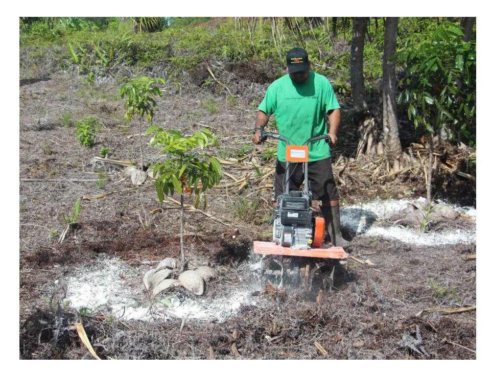
Figure 5. Applying lime (CaO) with a hand tiller to Swietenia macrophylla seedlings on Yap, Federated States of Micronesia.

Vegetation was sparse to non-existent at the site, so no vegetation control was performed. Two separate experiments were installed on Yap in August 2018. Each trial consisted of four blocks and two treatments with eight trees per plot per treatment. In the first experiment, lime (quicklime, CaO) was applied at a rate of 2.7 kg/tree and incorporated into the soil with a hand tractor in a 1.1 m radius around the stem (Figure 5) with control trees left unlimed. The amount of lime was calculated to be enough to raise soil pH by one unit. Yap Forestry had stocks of CaO available; commercial lime and fertilizers are only available in small quantities on the island.