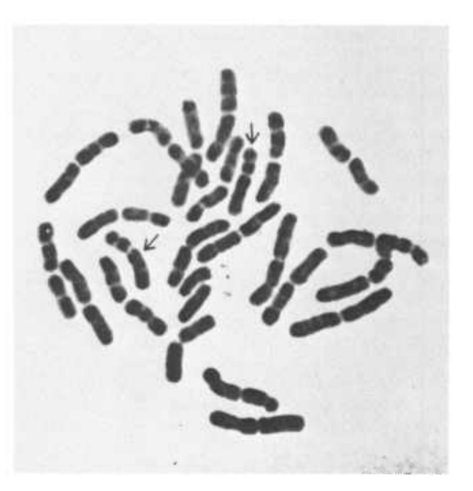
Figure 13.—Pinus taeda chromosomes from a root tip subjected to 33 hours pretreatment in oxyquinoline. Arrows denote the smallest chromosomes with submedian centromeres. 1650 \times . (Saylor 1961)

studied intensively, P. echinata apparently has a karyotype closely resembling that of loblolly and longleaf pines. On the basis of later work, it was concluded that P. echinata differs the most from the general pattern in Australes and it was the most nearly similar to P. taeda (Saylor 1972). It was learned also that P. rigida had a distinguishing feature in which the b arm of a chromosome other than number one is the longest. No differences were detected between the two varieties of P. elliottii. A very noticeable difference was found between the b arm sequence of the closely related P. caribaea and P. elliottii. In Contortae, all species have a b arm pattern of 5, 7, 9, except P. clausa, which differs at position 10.