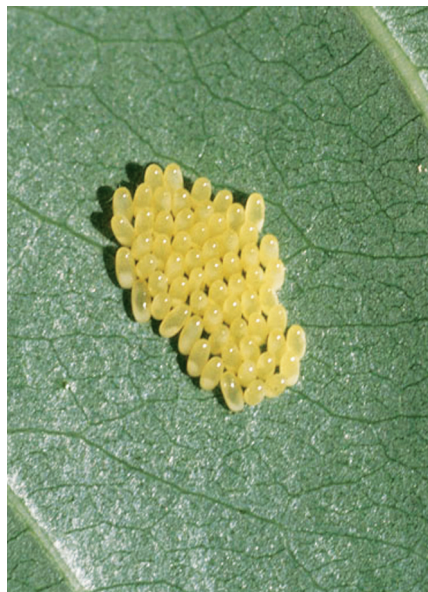
Figure 30.2 —Lemon-yellow egg clusters of the cottonwood leaf beetle.