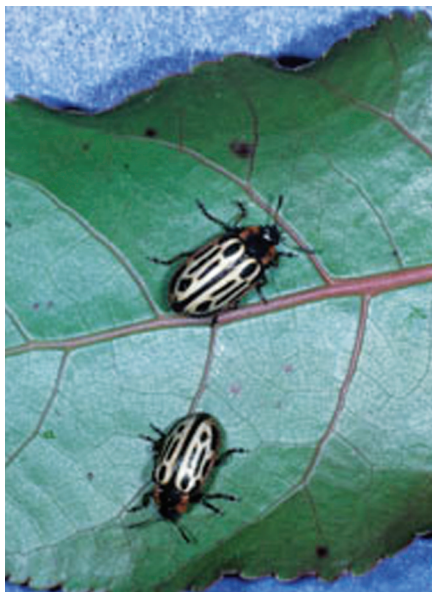
Figure 30.4 —Adult of the cottonwood leaf beetle.

Two whitish spots exist on the sides of each segment. When disturbed, the larvae release a pungent odor. Adults have a wide variety of color markings. Beetles are oval, yellow, and about 6 mm long, with slender black markings on their wingcovers (fig. 30.4). The head and thorax are black and the thorax margins are yellow or red.