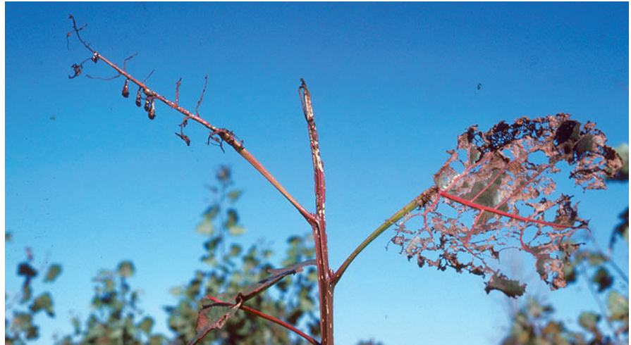
Figure 30.1 —Damage to terminals and leaves of cottonwood caused by cottonwood leaf beetles.

Egg clusters, gregariously feeding larvae, and adult beetles are present on the affected foliage. The lemon-yellow eggs (fig. 30.2) are laid in clusters of 15 to 75 eggs on the underside of the leaves. Larvae are blackish to gray and about 12 mm long when mature (fig. 30.3).