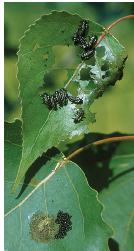
Figure 30.3 —Larvae of the cottonwood leaf beetle.