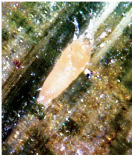
Figure 50.8 —An adult Trisetacus rust mite feeding on a white pine needle. Note the elongated body and the two pairs of legs. The mouthparts are between the first pair of legs.

Both spider mites and rust mites have natural enemies that keep their populations in check. Several arthropod natural enemies feed on spider mites. These enemies include beetles in the family Coccinellidae, anthocorid bugs, predaceous thrips, and predaceous mites in the family Phytoseiidae. By far the most important biological control agents are the phytoseiid mites.