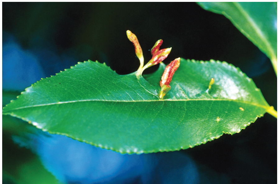
Figure 50.5 —Spindle-shaped leaf galls caused by gall mites on a Prunus leaf. The mites live and feed within the galls.

Rust mites cause similar damage to that caused by the spruce spider mite. Trisetacus species on conifers discolor needles (fig. 50.4). When infestations are severe, the needles yellow and eventually turn a reddish-brown or rusty color (hence the name rust mites). Feeding by gall-making eriophyoid mites causes the host to form distinctive, sometimes bizarre shaped galls (fig. 50.5). These gall-formers are common on deciduous hardwood hosts. As with the spider mites, the eriophyoids have piercing mouthparts that enable them to penetrate the plant cells.