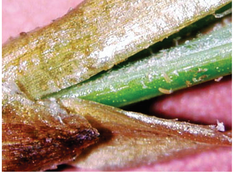
Figure 50.4 —Infestation of a white pine needle sheath by rust mites ( Trisetacus ). The top needle shows feeding damage. Mites are visible in the center right.

Rust mites cause similar damage to that caused by the spruce spider mite. Trisetacus species on conifers discolor needles (fig. 50.4). When infestations are severe, the needles yellow and eventually turn a reddish-brown or rusty color (hence the name rust mites). Feeding by gall-making eriophyoid mites causes the host to form distinctive, sometimes bizarre shaped galls (fig. 50.5). These gall-formers are common on deciduous hardwood hosts. As with the spider mites, the eriophyoids have piercing mouthparts that enable them to penetrate the plant cells.