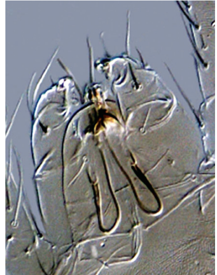
Figure 50.1 —Magnified (200x) image of a spider mite, Tetranychus platani , showing the mouthparts. The mite uses the long, paired, recurved stylets to pierce the plant cell and extract the cell contents.

Spider mites use their needle-like mouthparts (fig. 50.1) to pierce plant cells and suck out the cell contents, resulting in yellowing or browning of needles and leaves (fig. 50.2). Feeding by the spruce spider mite results in a mottled needle appearance; yellow spots appear on needles as the mites feed. The needles eventually turn yellow or brown. Associated with the discolored needles is a dense webbing made by the mites (fig. 50.3).