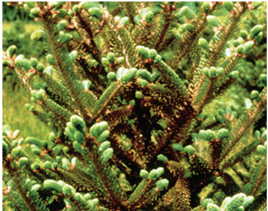
Figure 50.2 —Browned needles resulting from an infestation of the spruce spider mite, Oligonychus ununguis , a serious pest in conifer nurseries and plantations.