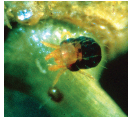
Figure 50.7 —An adult female of the spruce spider mite, Oligonychus ununguis . The body is dark while the legs and mouthparts are lighter in color. Below the female is an egg with the characteristic thin stipe at the top of the egg.

Rust mites in the genus Trisetacus overwinter as adults and eggs in the needle sheaths of their conifer hosts. In the spring, they move to new growth. Several