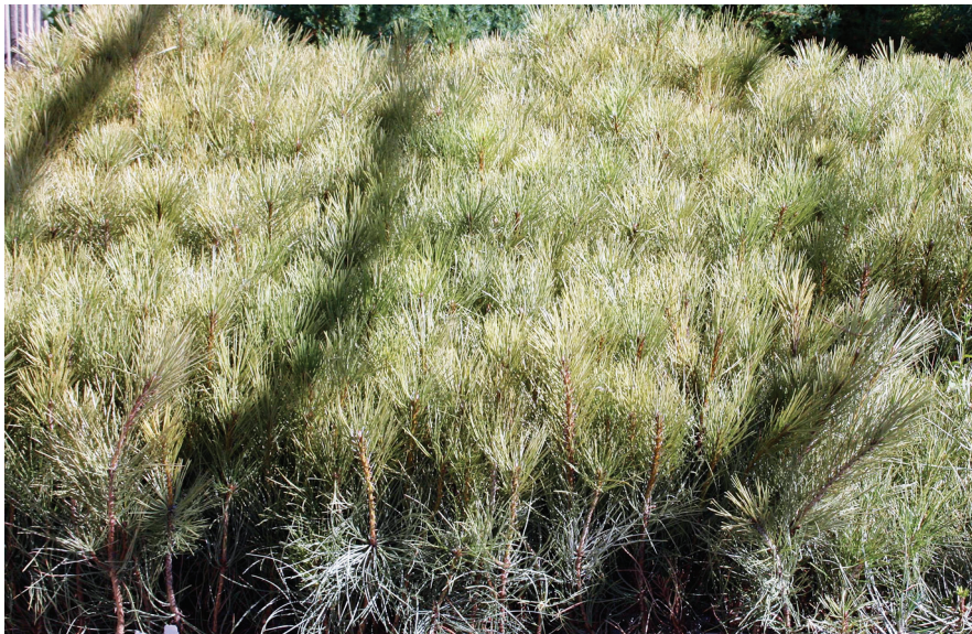
Figure 50.6 —Ponderosa pine seedlings damaged by Oligonychus subnudus show the characteristic pale, yellow appearance resulting from extensive spider mite feeding.

Spider mite presence is indicated by leaves or needles that are pale, washed-out, and discolored—yellow or brown needles are common (fig. 50.6). Heavy infestations during hot, dry summers can cause defoliation. Most, but not all, spider mite species form a fine webbing on needles and leaves. For example, spruce spider mites produce webbing that can form a dense covering over needles. Mites can be seen by shaking an infested branch over a white paper sheet. The mites fall onto the paper and appear as tiny red, yellow, or green specks on the paper. A careful look using a hand lens will show the mites walking on the paper. The mites have globular bodies (fig. 50.7) with four pairs of legs (three pairs in the larval stage). The eggs may be spherical or spherical with a stipe—a thin extension at the top. For example, spruce spider mite eggs are green when laid and turn reddish brown (fig. 50.7).