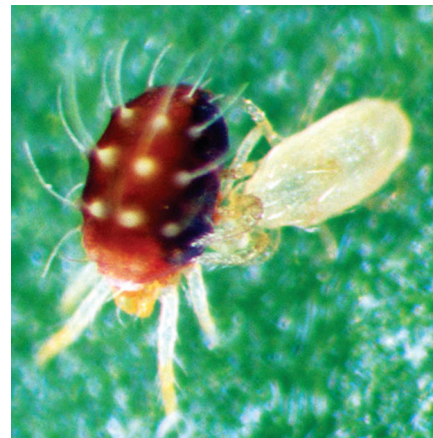
Figure 50.9 —A pale yellow phytoseiid mite, Galendromus occidentalis, feeding on a European red mite, Panonychus ulmi. Phytoseiids are important biological control agents against spider mites.