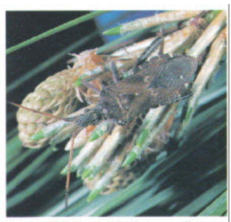
Figure 27-1—Adult of the seedbug Leptoglossus corculus.

Seedbugs (figs. 27-1, and 27-2) are sucking insects that feed on developing cones and seeds. Damage caused by these insects cannot be accurately diagnosed in the field; seed should be extracted from the cones and x rayed in the laboratory. The radiographs can then