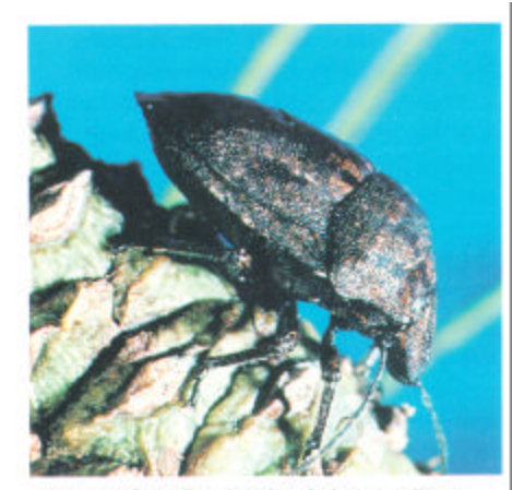
Figure 27-2—Adult of the seedbug Tetyra bipunctata.