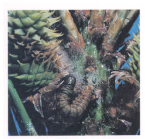
Figure 27-5—Frass and pitch on exterior of cone infested by the webbing coneworm, Dioryctria disclusa.