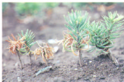
Figure 13-2—Seedlings of red fir affected by Phoma blight.