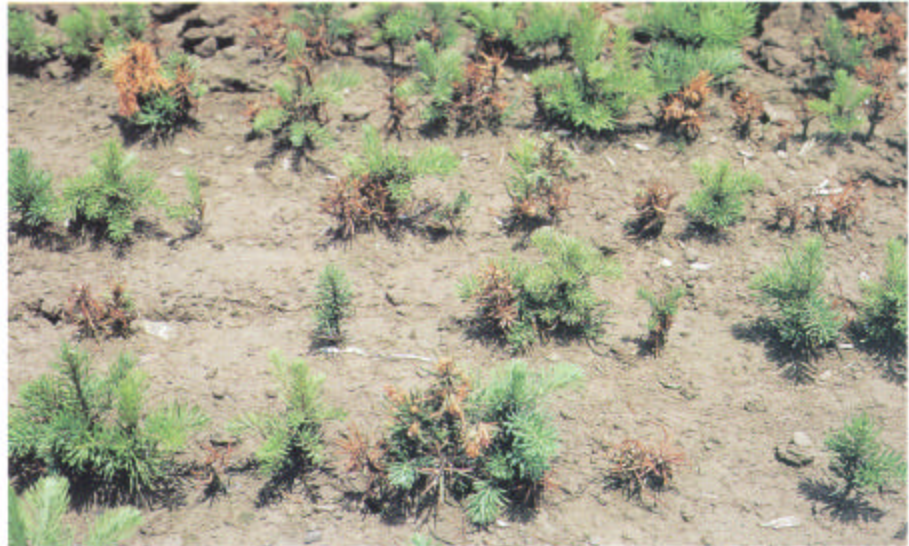
Figure 13-1—Seedlings of lodgepole pine affected by Phoma blight.

Phoma blight differs from lower stem canker (chapter 12) of Douglas-fir in the Pacific Northwest in that stem cankers are not formed and Fusarium roseum may occasionally be present, though