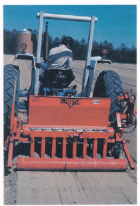
Figure I-11—Machine for applying mycelial inoculum to nursery beds.

In general, spore inoculum has not been as effective as mycelial inoculum in early establishment of Pt ectomycorrhizae on seedling roots. In addition, encapsulation of seeds of some species with spores inhibits germination somewhat. Nevertheless, spore inoculum appears to be practical in some nursery operations. Figure I-12 illustrates how the root system of lobiolly pine seedlings can be enhanced with Pt.