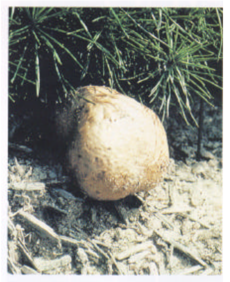
Figure I-10-Fruiting body of Pisolithus tinctorius.

Recent research has identified an ectomycorrhizal fungus, Pisolithus tinctorius (Pt), that is ideal for adverse planting sites (fig. I-10). Procedures have been developed for using Pt in bareroot and container nurseries. Studies have shown that