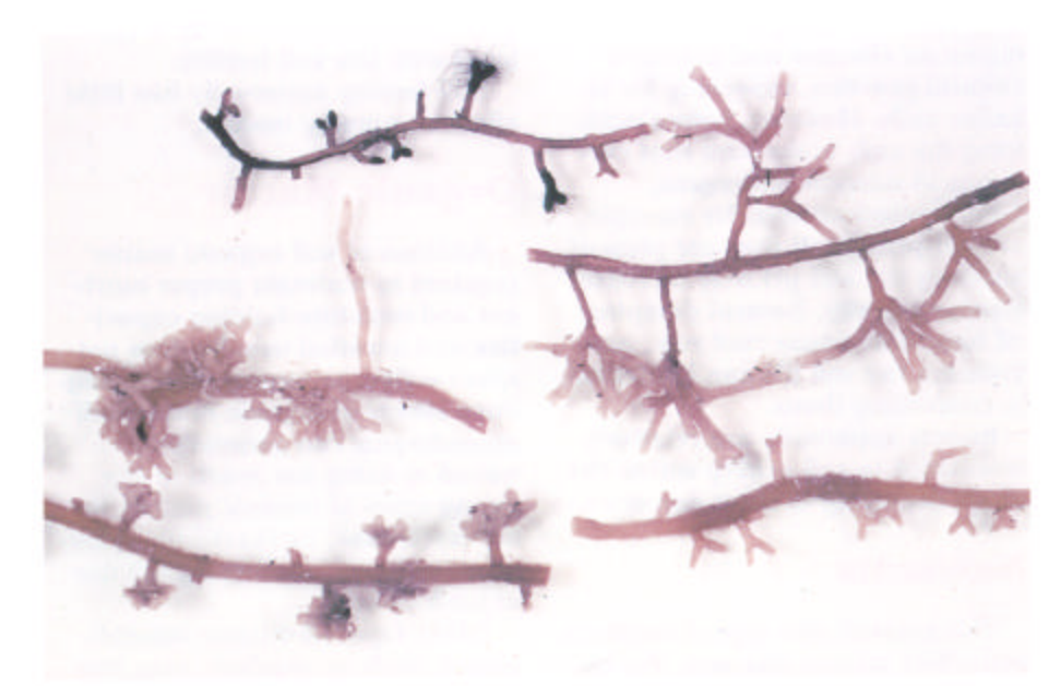
Figure 1-7-Several types of ectomycorrhizae on conifer roots.

grow into the root cells, and a mantle or exterior cover is lacking. Endomycorrhizal fungi frequently produce large, conspicuous, ornamented spores on hyphae attached