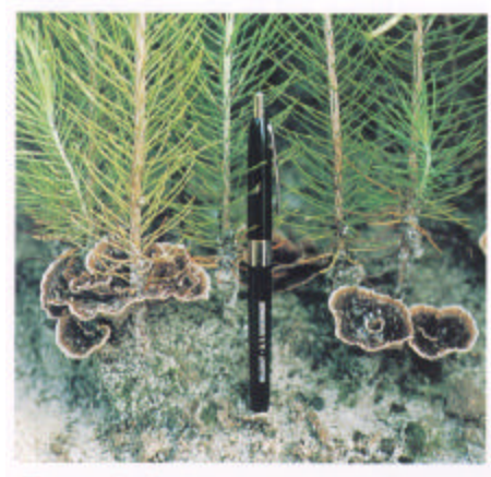
Figure I-9—Fruiting body of Thelephora terrestris.

common naturally occurring ectomycorrhizal fungus in bareroot seedling nurseries in the United States (fig. I-9). In southern pine nurseries, which usually produce 1-0 stock, 25 to 75 percent of feeder roots are ectomycorrhizal with T. terrestris by lifting time.