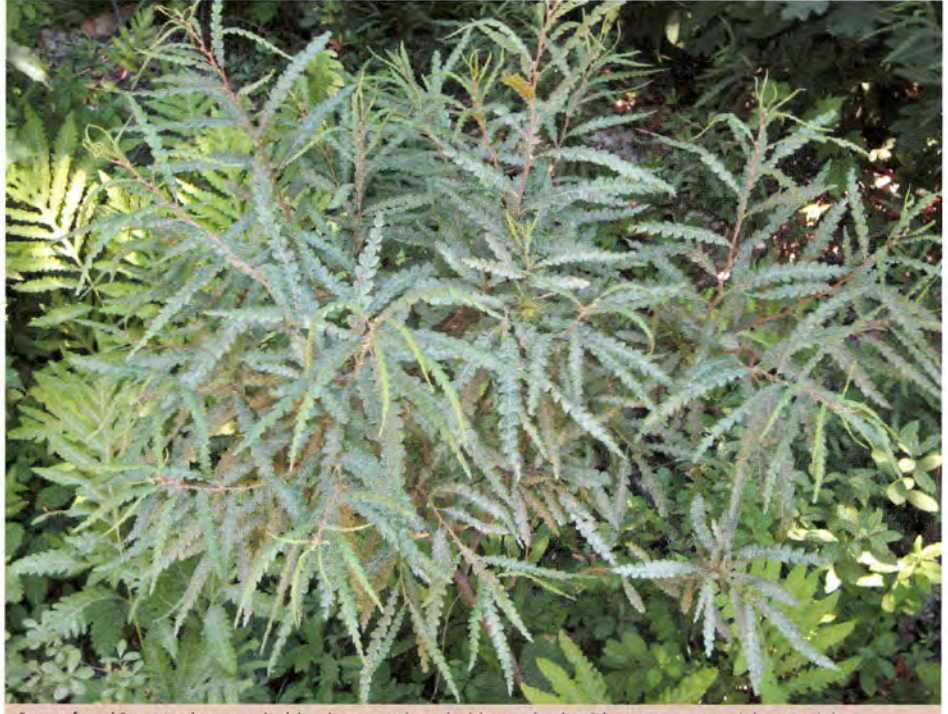
Sweet fern (Comptonia peregrina) is a low-growing, deciduous shrub with great commercial potential.

Despite these desirable attributes, the fact that sweet fern's propagation is not straightforward has held it back from being grown on a commercial scale. Propagation by seed is considered difficult because seeds have a complex dormancy. In nature, seeds fall from plants and become buried by organic matter. Over time, chemical inhibitors are leached out of the seed coat and seeds are scarified by the seasonal freeze-thaw cycles. Then, when environmental conditions are favorable for germination, seeds will germinate. Researchers Dow and Schwintzer found that seed-bank seeds had 70 percent germination, while fresh seeds off of living plants had only 1 percent germination. Plant propagators don't have the luxury of waiting a number of years for fresh seeds to naturally lose their various dormancies-they need seeds to come up soon after being sown.