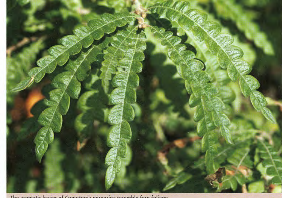
The aromatic leaves of Comptonia peregrina resemble fern foliage.

Two-gallon plants can be produced in a single growing season and will be ready for sale the following spring. To accomplish this, two liners (quart sized) should be transplanted into each 2-gallon container. Using two liners per container