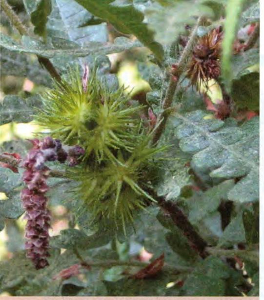
Sweet fern's ornamental interest includes nutlets and male catkins.