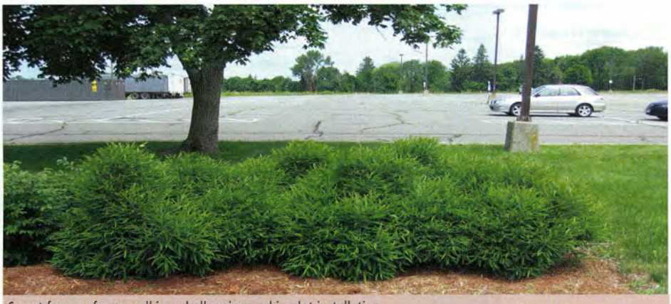
Sweet fern performs well in a challenging parking lot installation.