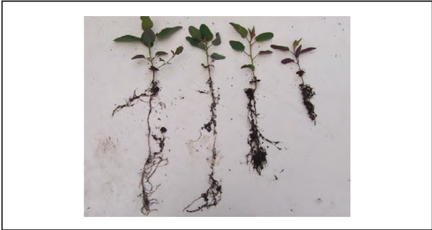
Figure 2. The effect of pot size on seedling caliper in the first 28 days from seed.

Note that air root-pruning has started already on the 3DARP seedling.