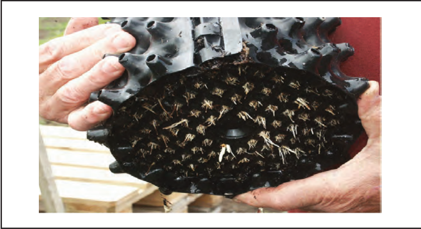
Figure 1. The third dimension in air root-pruning.

Consensus opinion among five tree growers with vast experience was that: more than 20% of advanced trees fail after planting and even more are seriously compromised.