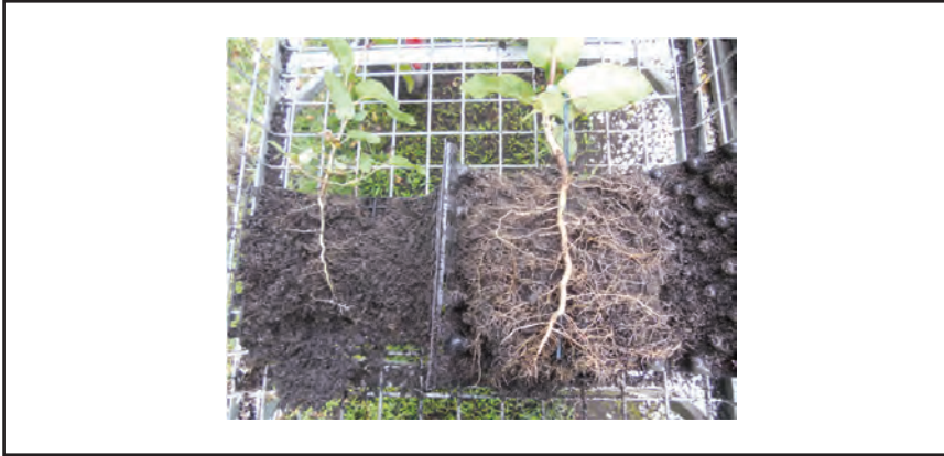
Figure 3. The two typical root systems — both at Day 133 from seed — show how the radical is surrounded by an array of laterals uniformly arranged in 3D space. LHS: sown in 1.5 litre 3DARP, RHS: sown in 8 litre 3DARP.