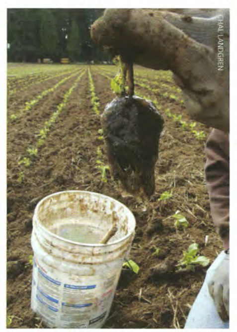
Researchers measured the survival and growth of seedlings treated with various additives, such as Zeba<sup>™</sup> Root Dip (pictured).

Most plantings for Christmas trees do not receive supplemental watering after planting, so any boost in additional available water through the summer and fall months should help improve survival rates and minimize replanting expenses. Likewise, any boost in initial plant growth could offer improvements in size and time to market for both nursery crops and Christmas trees.