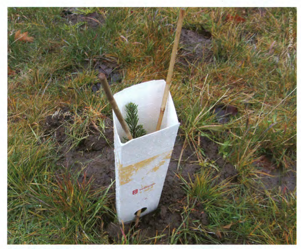
Researchers tested a variety of additivies on noble fir (shown) as well as barberries and hydrangeas.

In addition to these above-ground measurements, three entire plants from each treatment, at each site, were harvested. Extra care was used while digging to ensure all associated roots were collected for each plant. Plants were delivered to PlantHealth LLC in Albany, Ore., for evaluation of roots, including root mass, any mycorrhizae colonization and above-ground biomass.