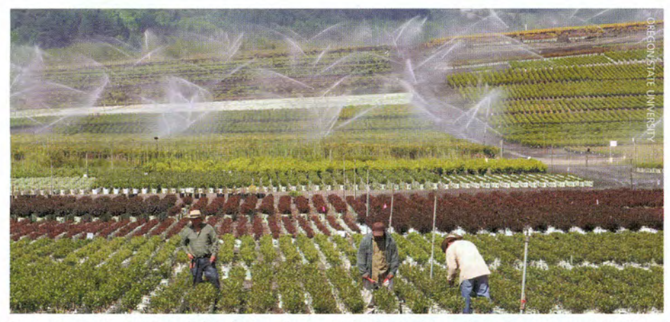
Researchers at Oregon State University have been studying how soilless substrates can be used together with moisture monitoring equipment to get the best results while reducing the need to irrigate.

Researchers are developing monitoring systems that can prevent overwatering and underwatering