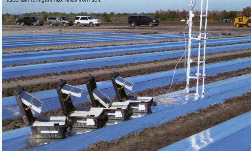
DAN CHELLEMI (D2247-1)

The vertical air-monitoring station located in the center of a fumigated field at a Duette, Florida, site is designed to continuously collect air samples at several heights. Fumigant-collection tubes were exchanged and air-sampling pumps calibrated every 6-12 hours for 10 consecutive days to ascertain fumigant flux rates from soil.