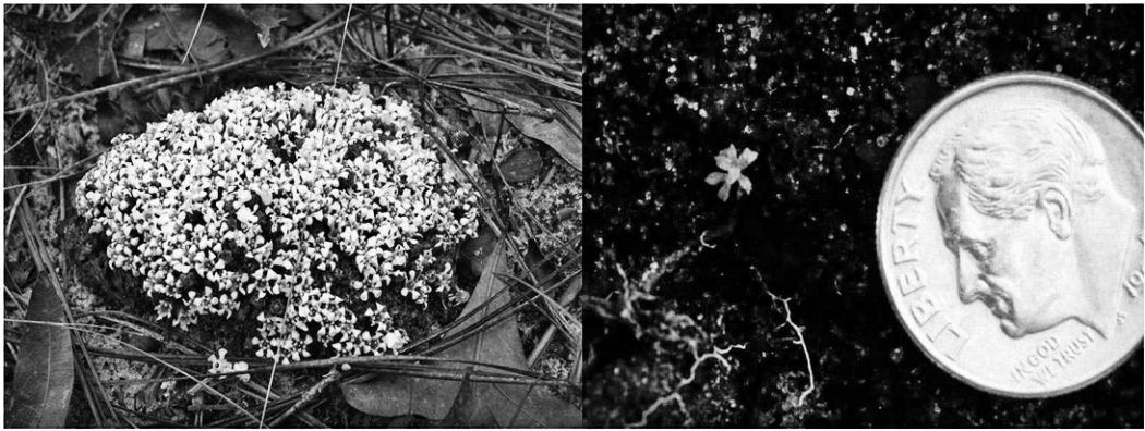
FIG. 1. Winter-flowering Pyxidantha brevifolia in full bloom on Fort Bragg (left) and ex situ propagated P. brevifolia seedling (right). Left photo taken 25 March 2009.

tablishment efforts, to identify the optimal germination conditions for P. brevifolia seeds, and to identify possible environmental controls on seed germination for this endemic Sandhills species.