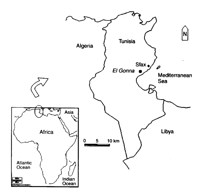
Fig. 1. Location of the El Gonna study site 20 km west of Sfax in southeastern Tunisia, North Africa.

area was protected from grazing by the Forest Service (Forest General Direction) and planted to 1-year-old Acacia salicina Lindl., Pinus halepensis Mill. and Eucalyptus occidentalis Endl. seedlings. Average planting density was 300-500 trees/ha, resulting in an average tree spacing of \sim 6 \times 5.5 m.