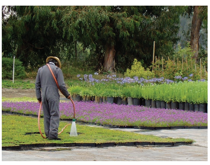
Hand-watering accounted for 18% of the production area in surveyed nurseries. Experienced personnel are necessary to avoid overwatering, and an on/off valve is recommended.

Runoff. The six questions in the runoff management category covered the collection and recycling of irrigation and storm-water runoff. Good management practices were not common, but their adoption increased from the initial survey to the resurvey in 2006. Pooled "yes" responses were only 10% in 2004, but increased significantly to 20% in 2006, with 43% "not applicable" (table 1).