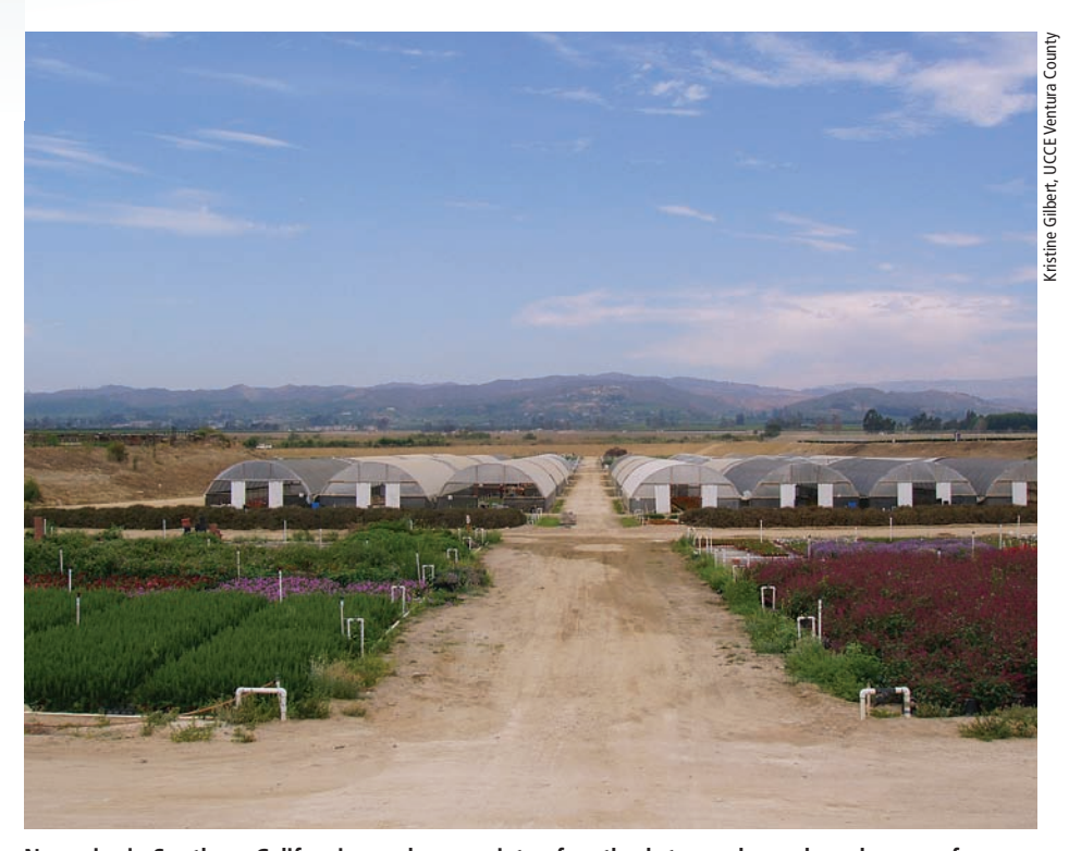
Nurseries in Southern California employ a variety of methods to produce a broad range of products. Eighty percent of the surveyed production area was uncovered, while the rest was in greenhouses and shadehouses, with numerous irrigation methods.

alifornia's nursery and flower industries each rank among the top 10 agricultural commodities in the state, with a combined $3.8 billion in sales in 2006 (CDFA 2007). California's nursery industry is the largest in the nation, and is concentrated particularly in the central and south-coast counties (CDFA 2007). The intense application of fertilizers, pesticides and irrigation water has made runoff from these facilities an environmental concern. Practices recommended to minimize potential pol-