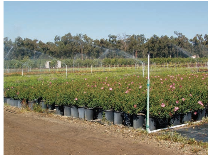
Overhead irrigation was used in 30% of the surveyed production area. If containers are not closely spaced, a significant portion of the applied water falls between containers and is wasted as runoff.