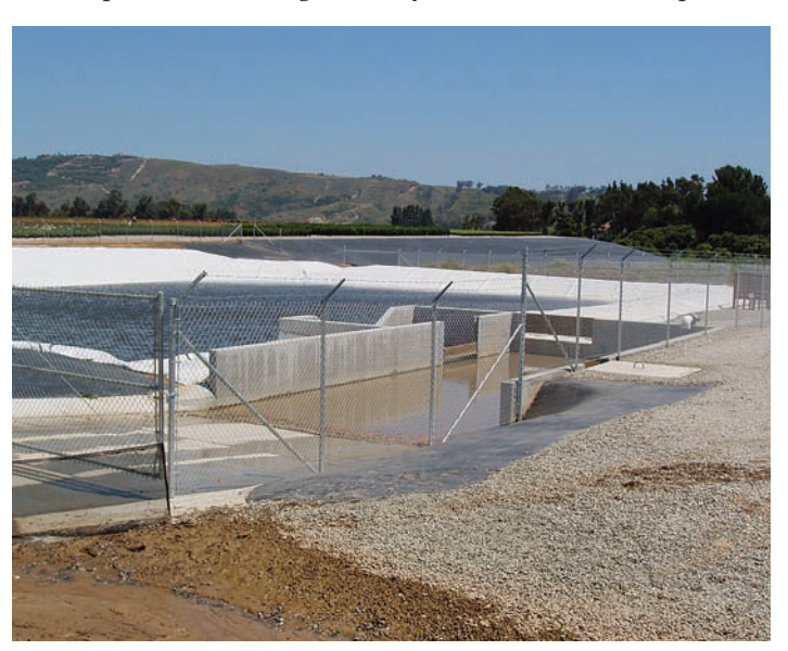
A retention basin allows runoff to be treated and recycled for use as irrigation water. Ventura County nurseries that recycle irrigation runoff significantly increased from 6% in 2004 to 14% in 2006.