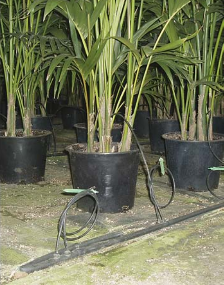
Drip tape, left, and microirrigation stakes, right, are low-volume irrigation methods. In Southern California, 51% of surveyed production areas employed a low-volume irrigation method. When properly scheduled, such methods are effective in preventing runoff.