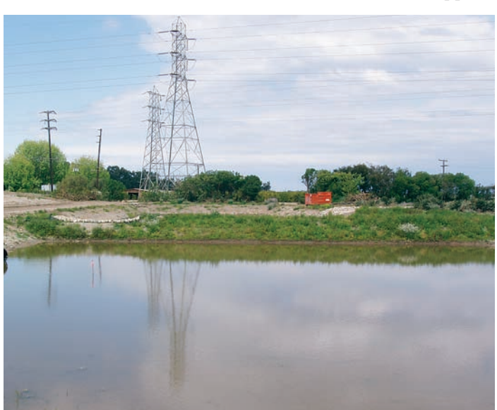
The unlined bottom of this detention basin allows captured runoff to percolate slowly into the ground. Soils and vegetation remove some contaminants from the water as it percolates or is taken up by plants.

Container media. The three questions in the container-media management category concerned mixing potting media in a sheltered area, measuring mediawater holding capacity and the use of wetting agents. Good practices for container-media management were commonly adopted, with 66% "yes" and 9% "not applicable" responses in 2006. The number of positive responses increased significantly from 2004 (table 1). Specific