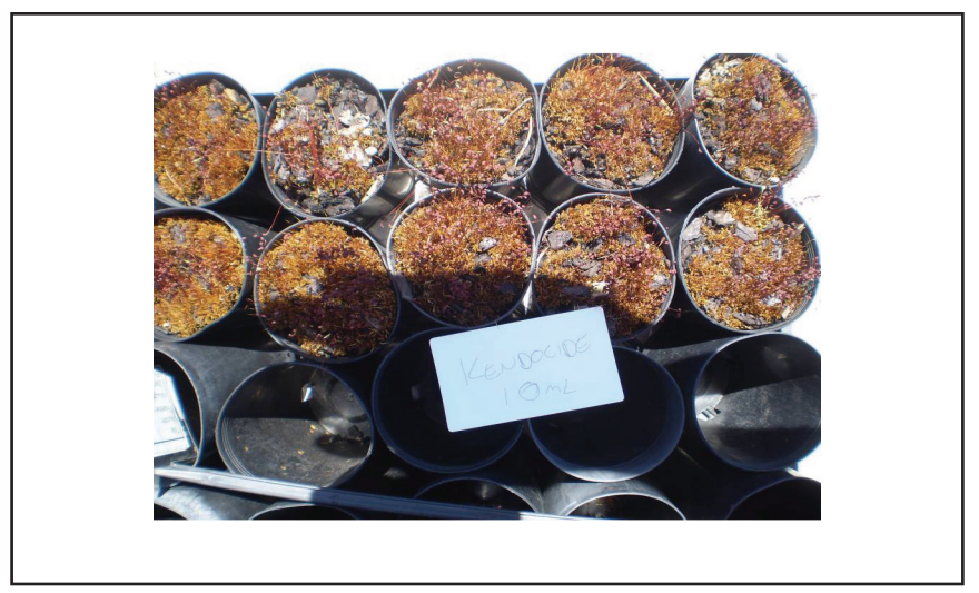
Figure 3. Example of browned moss (Kendocide 10 \text{ ml} \cdot \text{L}^{-1} ).