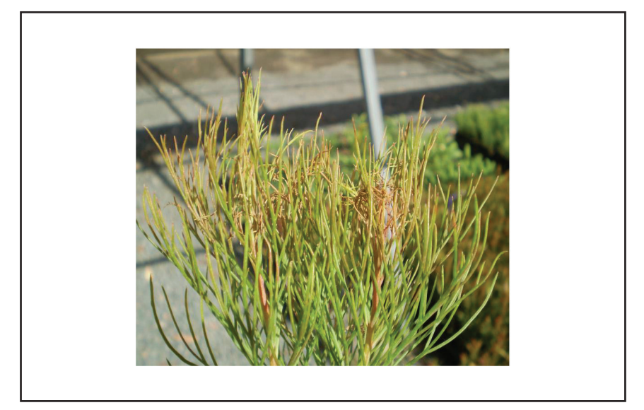
Figure 7. Example of phytotoxicity on Serruria 'Blushing Bride'.