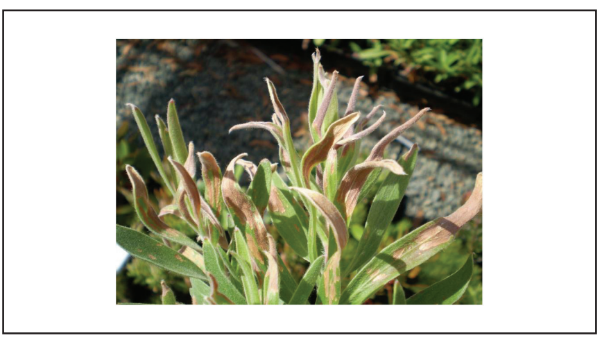
Figure 6. Example of phytotoxicity on Leucospermum 'Succession II'.