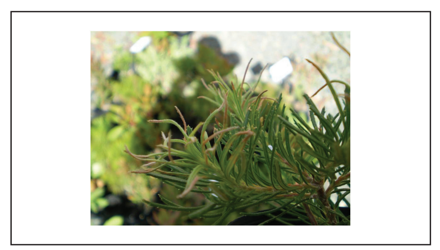
Figure 5. Example of phytotoxicity on Banksia ('Birthday Candles').

A follow-up trial was conducted using Surrender and Kendocide (both at a medium rate) but not vinegar as a negative result was achieved at the lowest possible rate. Both chemicals produced the same result as that found at the high rate of application as above.