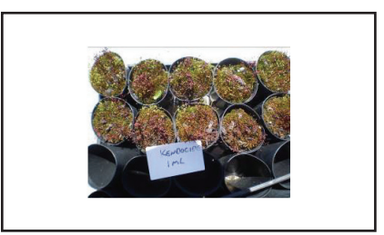
Figure 2. Example of unsuccessful results.