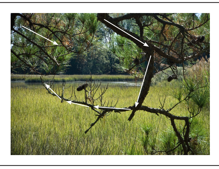
Figure 4. Using "leading lines" and shapes to draw the viewer's eyes into and move the eyes around the image.

uncomfortable and cause the viewer to lose interest. Negative or unused space also helps the viewer focus on the subject. Every bit of the frame doesn't have to be filled.