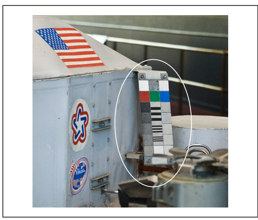
Figure 2. Gray card on the Lunar Lander.

Gray Card. When shooting Raw, plan to use a gray card. A gray card uses a standardized neutral gray (or other neutral colors) and can be used during processing to correct colorcasts. The process only requires a single click on the gray card and the image will be corrected. Figure 2 is a photo of the NASA Lunar Lander that now resides in the Smithsonian Air and Space Museum in Washington, D.C., U.S.A. Note that scientists placed a permanent gray card on the Lander so images taken on the moon could be color corrected. The critical importance of accurate color cannot be understated for us or for NASA. It can be costly or impossible to retake the photos.