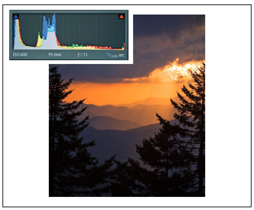
Figure 1. A histogram is a picture of light in a graphical representation captured in an image by a digital camera.

"JPEGs" complete post processing within the camera and allow for printing directly from the camera. JPEGs use an eight-bit color depth workspace that restricts the output to 256 tones per color channel and discards additional data it deems unnecessary for printing. If post processing, a JPEG file will degrade when worked on. Always work on a copy of the original file to avoid permanent losses or use a program like Adobe® Photoshop® Lightroom® (Products from Adobe Systems Inc.). It creates a separate attached file of digital changes that doesn't change the original image file (similar to the way Raw images are handled). While nondestructive of the original file, it retains the 256-tone limit. Always capture the image in the highest quality JPEG format for best quality.