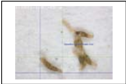
Figure 4. Spiranthes odorata 'Chadds Ford' seed 140X.