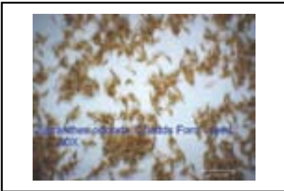
Figure 3. Spiranthes odorata 'Chadds Ford' seed 40X.