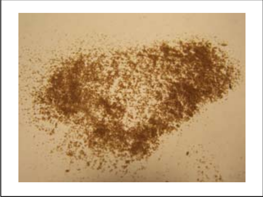
Figure 2. Spiranthes odorata 'Chadds Ford' seed no magnification.