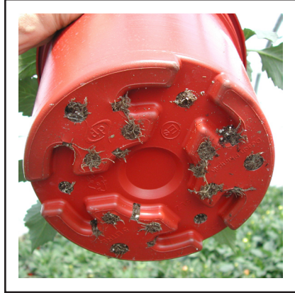
Figure 6. Aquamats work with pots from 3 inch to 3 gallon.