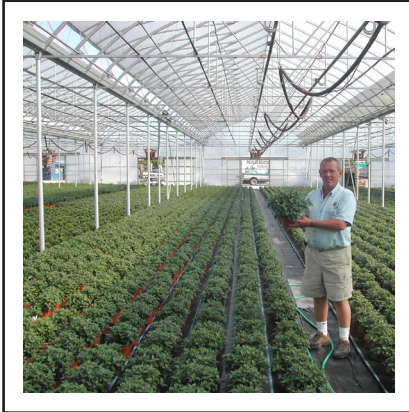
Figure 1. Use of Aquamat on a greenhouse floor.