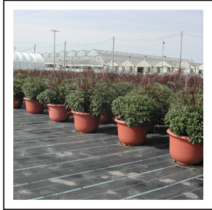
Figure 2. Use of Aquamat on an outdoor growing area.