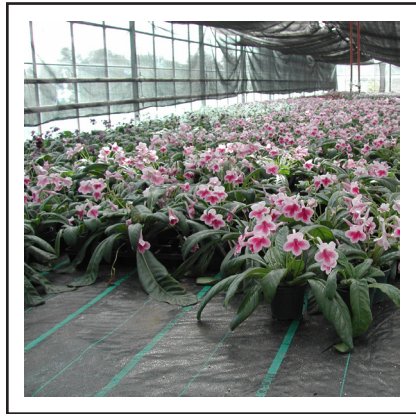
Figure 4. Using Aquamat to finish potted crops.