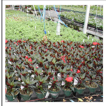
Figure 9. Aquathermat used for finishing crops.