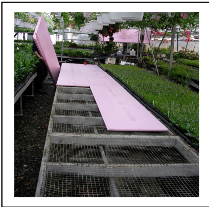
Figure 10. Installing bottom insulation in combination with Aquathermat.

Aquathermat Applications. It can be used from propagation (for example under mini tunnels to avoid overhead misting and diseases) (Fig. 8) to the finishing of crops. For such application it can be used on benches or directly on the floor (Fig. 9). In addition, bottom insulation (Fig. 10) can provide a 40% energy saving and better heat uniformity on crop.