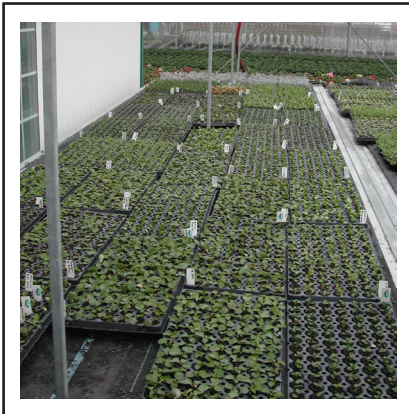
Figure 3. Use of Aquamat on a propagation bench.