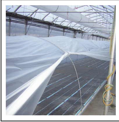
Figure 8. Aquathermat used for propagation under mini-tunnels.