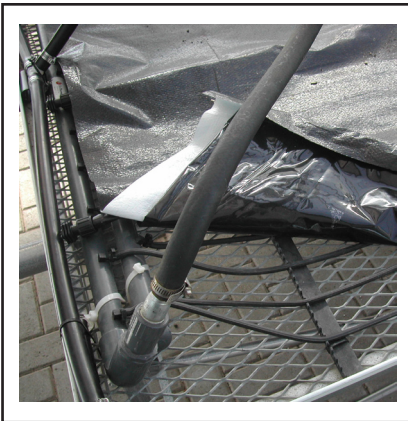
Figure 7. Using Aquathermat with root-zone-heating system.

designed custom manufacturing equipment and fine tuned the processes to produce Aquathermat.