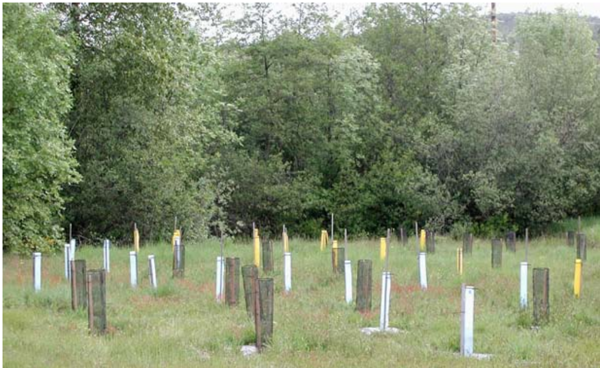
Figure 6.—In any restoration planning, it's very important to take steps that will maintain genetic variation in restored populations, both as a buffer against short- and long-term environmental changes and to reduce problems of inbreeding.

Genetic theory indicates it's best to have a minimum of 20 unrelated seed parents represented in a