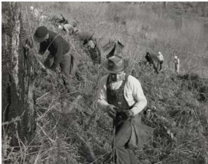
Figure 2.—Replanting the Tillamook Burn illustrated the importance of using local seed sources. Trees from more distant sources did not do as well as trees from nearer seed sources.

If native does not mean local, how does one define local? The scholarly literature has many articles asking the question “How local is local?” Unfortunately there is no simple definition that applies to all species, but scientists do know that non-local kin often are not as well adapted as local populations. For example, plants from Mount