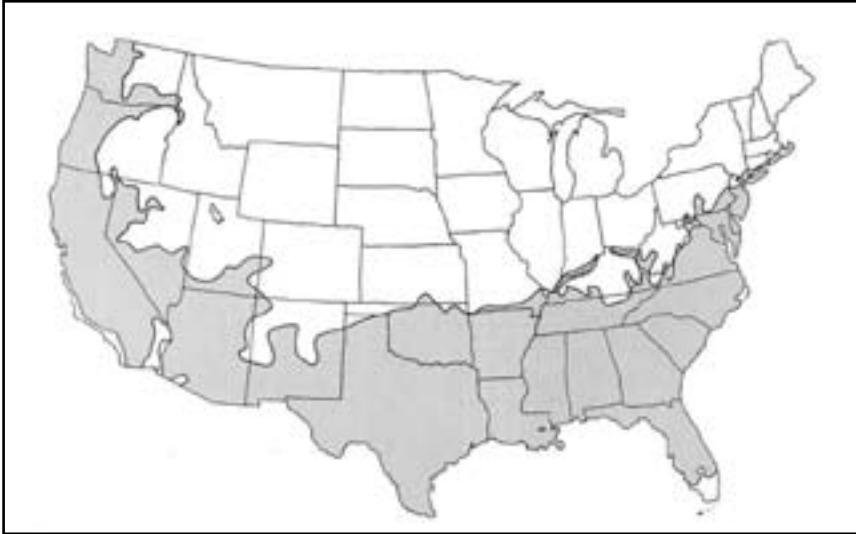
Figure 1. Potential planting range for loblolly pine trees in the United States (Gilman, 1994).

fertilizer, one could conceivably produce a substrate for under $15 per \text{yd}^3 compared to $40 plus for traditional P substrates and $15 plus for aged PB. Since WoodGro™ is ground to the correct particle size to provide the desired aeration and water holding capacity, there is no cost associated with adding aggregates such as perlite and vermiculate as required for P substrates.