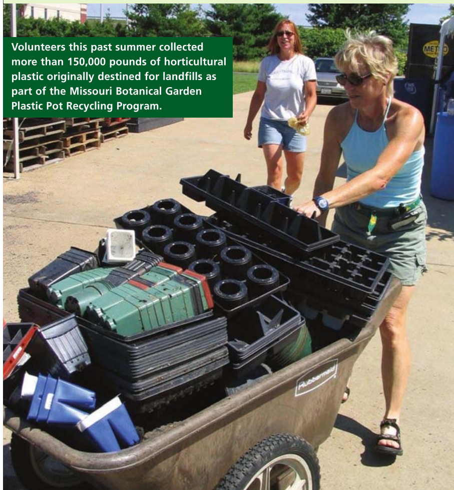
Volunteers this past summer collected more than 150,000 pounds of horticultural plastic originally destined for landfills as part of the Missouri Botanical Garden Plastic Pot Recycling Program.

sumers as retaining wall ties and timbers for use in landscaping projects. The plastic timbers are water- and pest-resistant, and can be cut and drilled similar to wooden lumber.