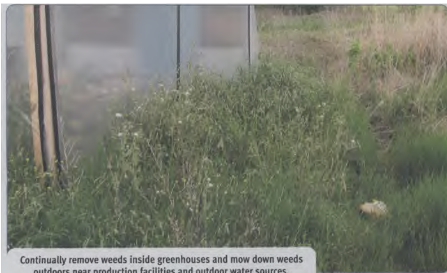
Continually remove weeds inside greenhouses and mow down weeds outdoors near production facilities and outdoor water sources.

Sphagnum peat is naturally hydrophobic, and when dry, repels water due to the remains of the waxy