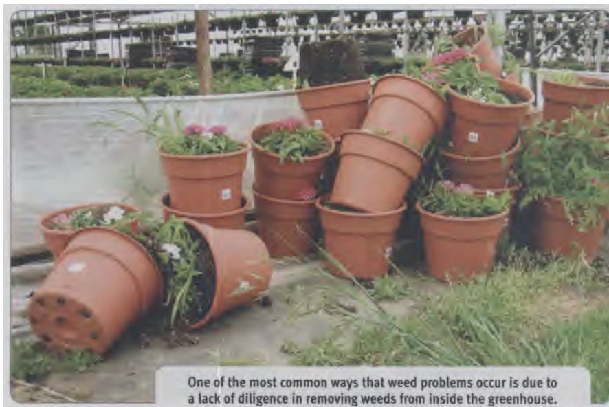
One of the most common ways that weed problems occur is due to a lack of diligence in removing weeds from inside the greenhouse.

Numerous biological products have been developed to be added to media to suppress soil-borne diseases. Some biological agents are strains of specific species of Bacillus , Streptomyces and