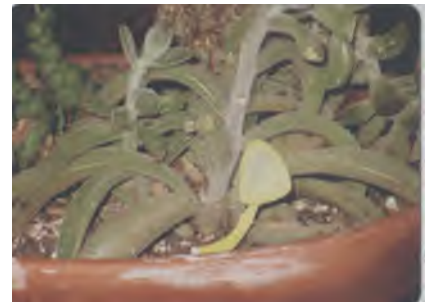
Mushrooms, which are occasionally found in commercial growing media that contain composts, are promoted by cool, moist conditions.

The flower pot fungus ( Leucocoprinus birnbaumii ) is probably the most common mushroom found in commercial growing media. It tends to be most common where composts