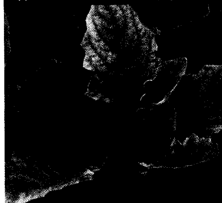
A common nutritional problem of a high substrate pH is iron deficiency. The disorder is denoted by the interveinal chlorosis of the youngest leaves. Testing the substrate pH to determine if it is above 6.4 will aid in confirming the diagnosis.

improperly working fertilizer proportioner can cause nutrients to be less than optimum in the substrate. Weekly calibration of the injector is required. The significant problem with equipment failure is the introduction of multiple nutrient deficiencies.