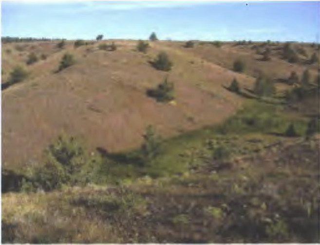
Figure 2. Large A. acuminatum population near Buchanan (Harney County, Oregon). Pink areas of the hillside haze are flowering A. acuminatum .