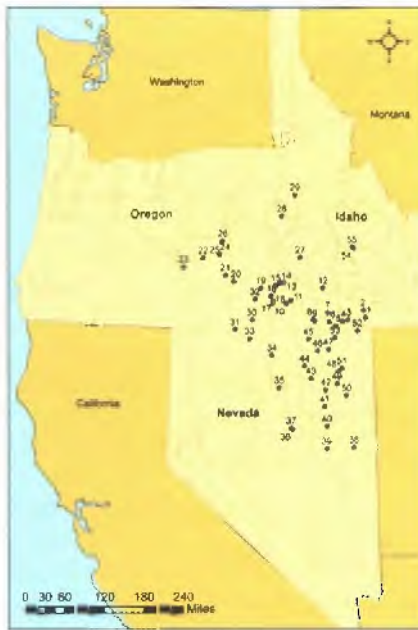
Figure 7 Distribution of A. acuminatum collection sites across the Great Basin.