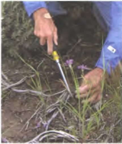
Figure 4. Collecting A. acuminatum bulbs in southern Idaho.

opening an effective sampling plan. With some introductory training on GIS software and mapping, members of the plant genetic resource community can benefit from this application. Many Internet and university-related educational opportunities are available (for example, ESRI™ Virtual Campus [ESRI 20061]), as are free mapping software programs from the International Potato Center at Lima, Peru, website (DIVA-GIS 2004).