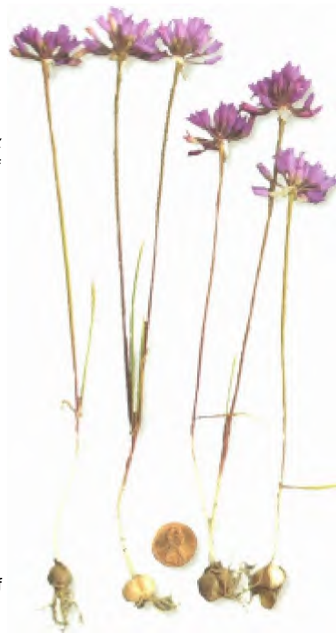
Figure 1. Allium acuminatum collected at Roland Road (Owyhee County, Idaho) showing umbels, stapes, and bulbs.

Garlic is historically the most important allium species utilized for medicinal properties, but other species have also received attention (Goldman and others 1995). Some traditional folk remedies involve the use of garlic as an antiseptic, diuretic, earache treatment,