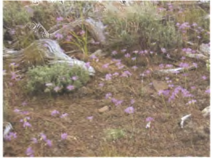
Figure 3. Allium acuminatum population growing near the North Fork of the Owyhee River (Owyhee County, Idaho).

91.1% were single bulbs, 8.7% were cloved bulbs (two attached sister bulbs), and 0.2% were 3-cloved bulbs (three attached sister bulbs). Most bulbs were globe-shaped (90.3%), 6.8% were classified as flat-globe, and 1.9% as high-globe (Figure 8).