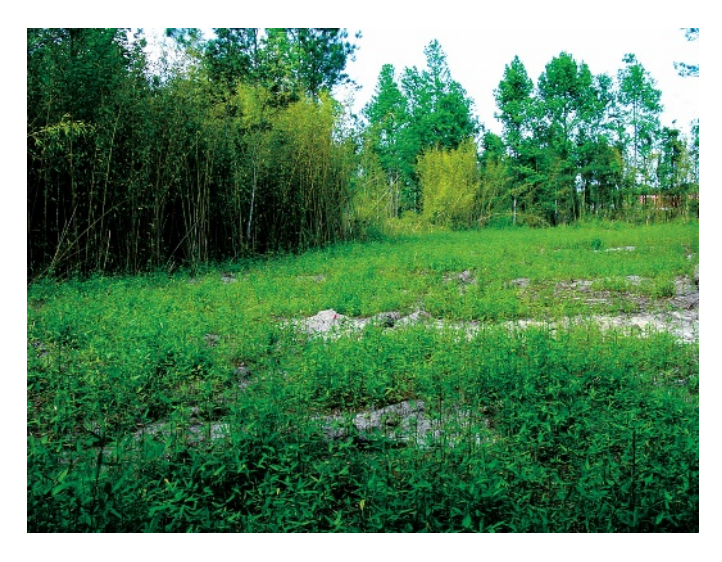
Figure 2. Area of red-margined bamboo before treatment applications in 2002.

Figure 3. Red-margined bamboo cover 58 wk after treatments were applied in the 2002 experiment (A, nontreated control; B, imazapyr 1.7 kg ai/ha; C, glyphosate 4.5 kg ai/ha).