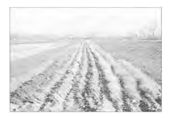
Figure 1. Some nurseries still store bareroot hardwood seedlings in traditional "heeling-out" beds because of concerns over storage molds.

The type of storage package and when the seedlings are packaged depends on the type of stock. Conifer seedlings need some sort of protective packaging to retard moisture loss and prevent injury durin g the storage period, and so typically are packaged immediately after harvesting and grading. On the other hand. some nurseries prefer not to package hardwood seedlings before storage because of concern about molding. The traditional storage method is to store bareroot hardwood seedlings on open racks in coolers or in heeling-in beds in the field (Figure 1), and then package them just prior to shipment. However, research has shown that bagged hardwood seedlings or those with just their roots enclosed in bags suffer much less stress.