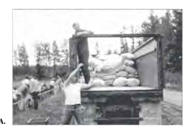
Figure 5. Although research studies have shown that physical shocks and mishandling do not cause major injury (A), all types of abuse are cumulative and can only decrease seedling quality (B—see figure on following page).

Physical shock — Several studies have shown that seedlings are relatively tolerant to vibration and dropping. Although research has shown that rough handling and shocks during have relatively minor effects on seedling quality. they are accumulative and so should be avoided ( Figure 5a ). This is one of those cases where common sense should prevail over the need for validation through research.