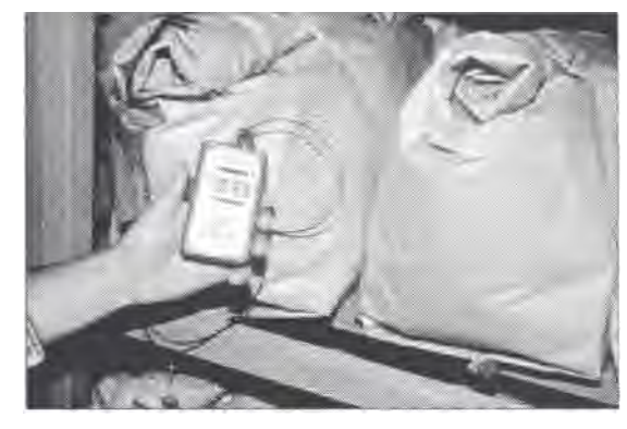
Figure 3. Although ambient temperature readings indicate how the refrigeration equipment is functioning, the true indication of storage temperature can only be obtained with in-bag monitoring.

Several pieces of equipment can be used to monitor seedling condition during storage. In-bag thermometers have already been mentioned but the advent of data loggers have revolutionized the technology. Data loggers are self-contained recording devices that monitor temperature, humidity and other weather