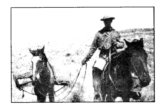
Figure 1. Seedling storage and delivery were quick and easy when nurseries were located close to the outplanting site.

back on those days and knowing what we now do about seedling physiology, it's amazing how well those early plantations performed.