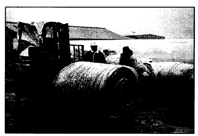
Figure E. Plastic nursery film can be baled with conventional farm equipment.

to participate in this program, please contact Ron Lapotin with a list of what types of used plastics that you have, an estimate of how much (weight or volume), and when they would be available: