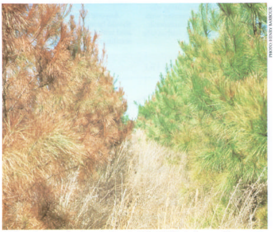
Cold weather damage in a Kentucky plantation. Left: Loblolly pine from a south coastal source; right: loblolly pine from a northern Piedmont source.

When seedlings from a poorly adapted source are planted, the plantation can fail or growth reductions can adversely affect yields throughout the rotation. Poor adaptation in the South causes early mortality from drought, freeze damage, ice (glaze) damage, fusiform rust infection, and slow growth.