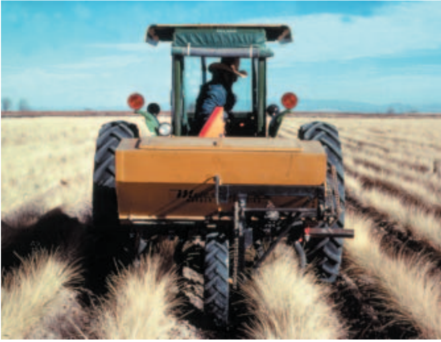
Figure 2. Using a side dresser to fertilize a grass seed field at the USDA Natural Resources Conservation Service Aberdeen Plant Materials Center in Idaho.

number of acres planted under dryland conditions failed to establish.