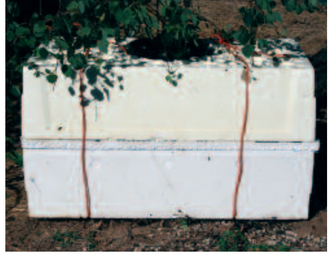
Figure 3. Spunbonded fabric is used to prevent growing medium from washing out of this 3 layer stack of propagation Styroblock ^{\text{TM}} containers.