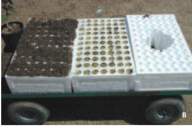
Figure 1. Stacked propagation is ideal for reproducing limited parent material such as these quaking aspen seedlings (A). A 1-gal plant is placed into a "cover" Styroblock™ (far right), which is stacked above "propagation" blocks filled with growing media (B).