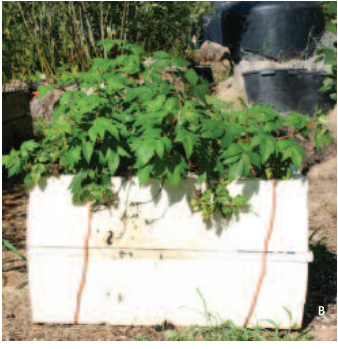
Figure 5. Stacked propagation is also being tried on native shrub oaks (A) as well as wild raspberry (B).