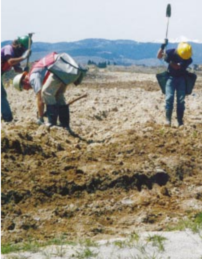
Figure 1. Restoration planters wielding hoedads, Silverbow Creek, Montana.

distribution, species composition, soils (or lack thereof), amount of competing vegetation to be removed, whether the plants are pre-pulled from containers, and so on. "J-rooting" (folding up the roots in the hole), "slip-planting" (setting the roots in a non-vertical position), and setting the plant at an improper depth are all problems to watch for. The USDA Forest Service has full-time inspectors on their planting sites to minimize improper planting. An engaged and watchful crew leader can perform the same function.