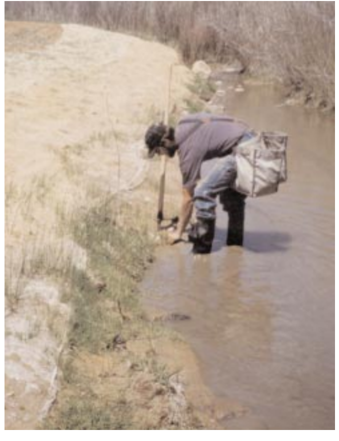
Figure 2. Dibble planting 50-ml (3-in<sup>3</sup>) wetland plugs, Monticello Creek, Utah.

Dibbles are great for planting wetland plugs though erosion control blankets with minimal damage to blankets (Figure 2). When sharp, they can also be used for planting small plugs directly into low-density coir logs. They cannot easily be used where specifications call for fertilizer packets or other such amendments. Compaction or "slicking" of the sides of the planting hole becomes a problem in clayey soils, so one should seek other tools for planting in clay. Dibbles do not work well in compacted, dense, or rocky soils. They are best used on level ground and are an excellent choice if you are planting directly into a water-covered site. (There's not much joy in swinging a hoedad into water, unless you just want to cool off!)