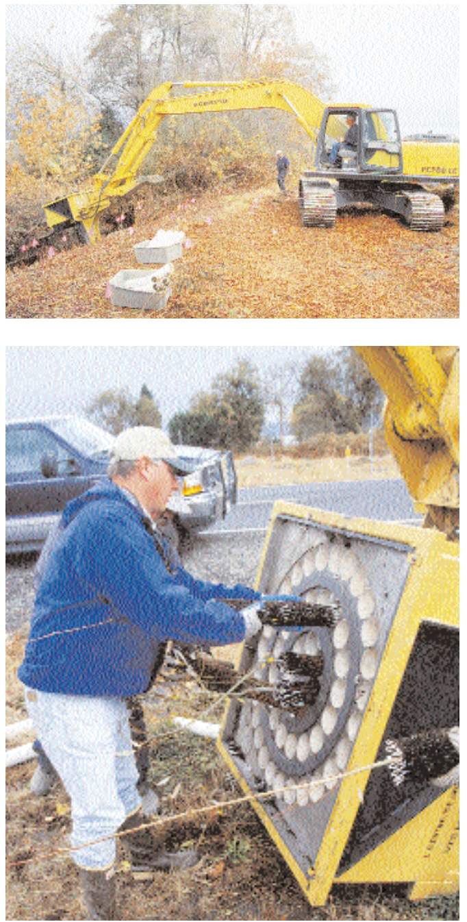
Figure 5. The expandable stinger working on a riparian project and loading the "50-shot" head, Central Point, Oregon.

This article concentrates on methods for planting seedlings, generally defined as plants smaller than 20 l (5 gal) in size. For planting the really big stuff, such as balled and