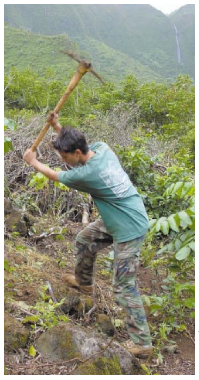
Figure 3. Planting with a pickmattock at Limahuli National Tropical Botanical Garden on Kaua'i, Hawai'i.

Jumping to power tools is an expensive step but is often called for with larger plant propagule sizes. While not easily utilized by volunteer and occasional crews, power augers, dibbles, and hammers can plant large seedlings and long cuttings under most conditions to a greater depth and with more efficiency than can hand workers. Safety and training becomes a much larger issue with any power tool, so allocate time and resources for these important actions.