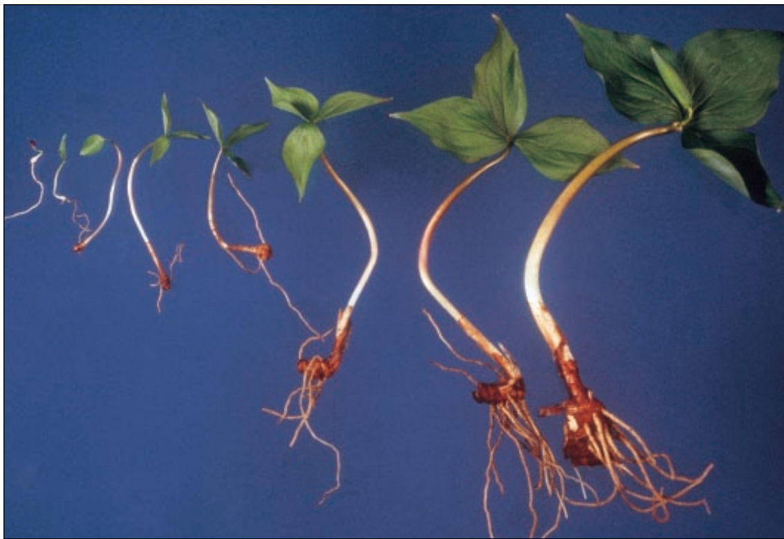
Figure 3 • Development stages of Trillium grandiflorum plants collected from the wild. Left to right: immature rhizome and cotyledon with seed coat attached after first cold period; mature cotyledon; first true (heart-shaped) leaf; whorl of 3 leaves; progressively larger leaves and rhizomes; and finally, flowering stage.