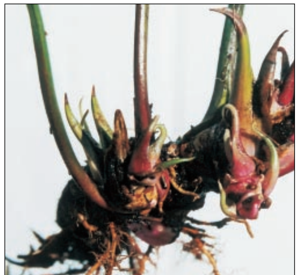
Figure 3 • Pitcher plant rhizome ready for division.

Rhizome divisions can be done easily for all species. The optimum time for divisions is during winter and early spring before bud break. Generally, seed-propagated nursery stock can be divided after 3 y, but more divisions are obtained from 5- to 6-y-old plants. After removing mature plants from containers or outdoor bog beds, I gently wash rhizomes with water and remove as much growing medium as possible so that identifying rhizome grow-