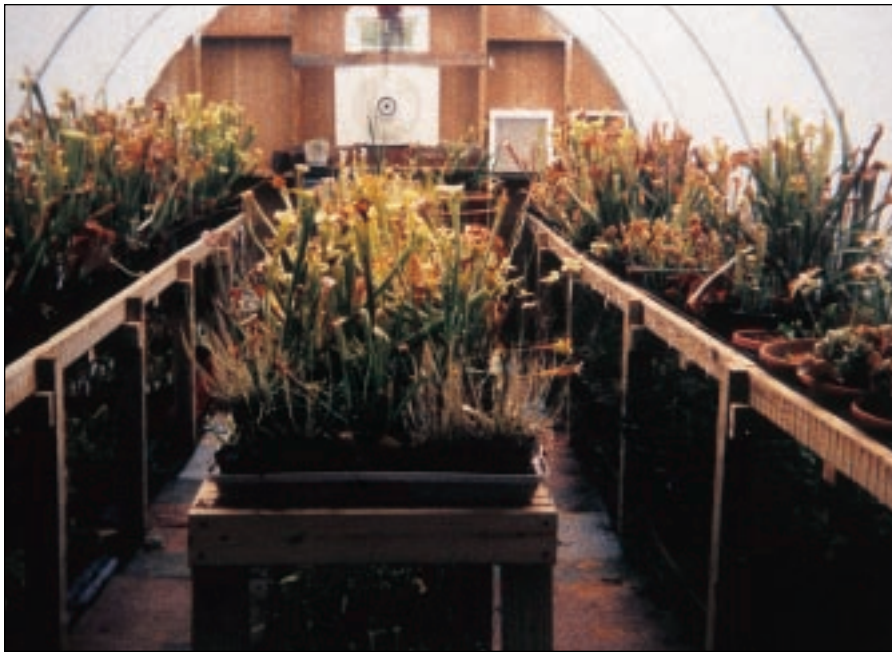
Figure 2 • Pitcher plants growing in the greenhouse at Darwin's Backyard Nursery.

[Sphagnaceae]). Successful propagation and growth of pitcher plants require creating these environmental conditions in the propagation environment.