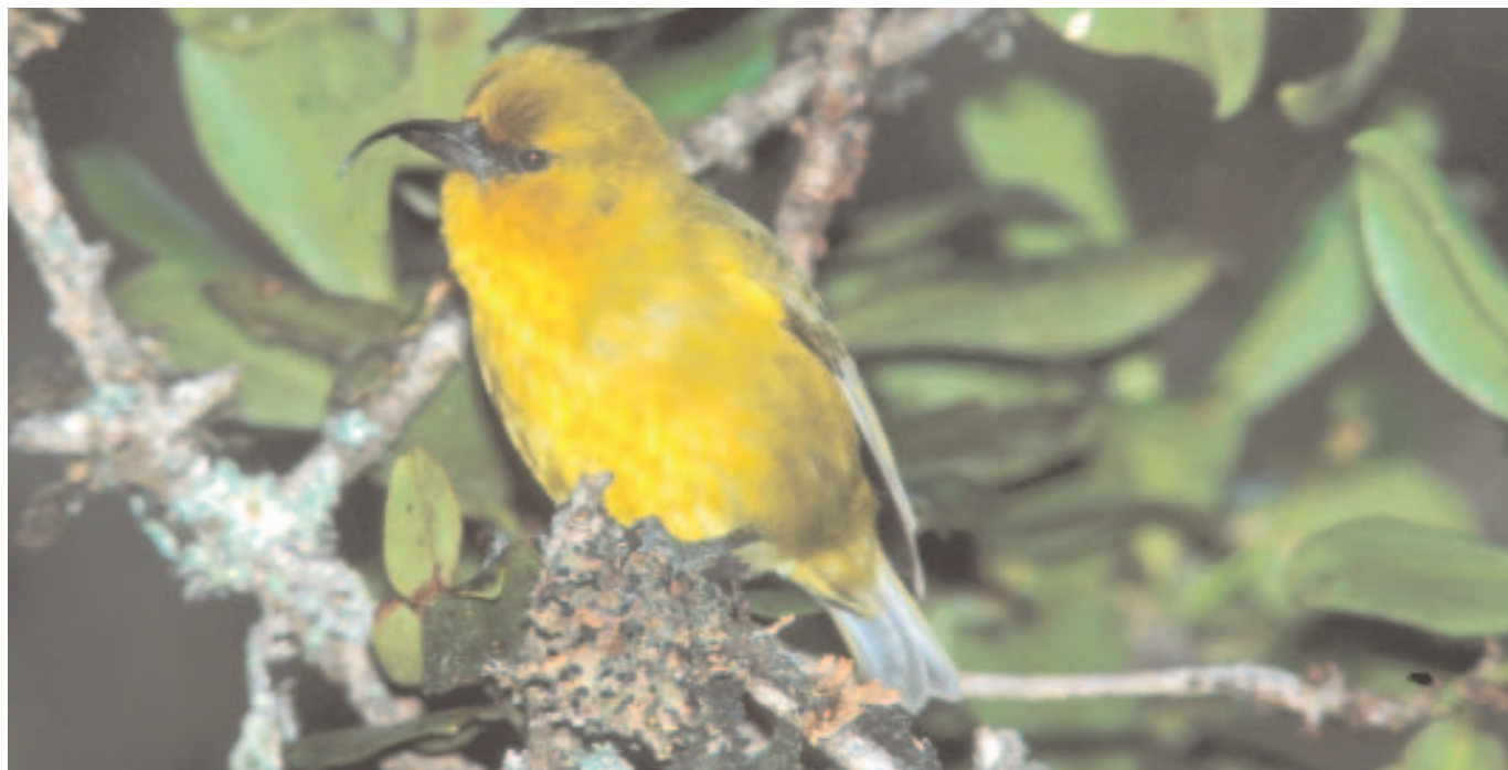
Figure 7. The highly endangered honeycreeper, 'akiapola'au ( Hemignathus munroi ), is benefitting from 15 y of tree planting efforts in Hakalau Forest National Wildlife Refuge.

A greenhouse was built in 1995 and Baron Horiuchi, the refuge's horticulturist, was hired to develop propagation and outplanting techniques for other native species. Fourteen additional native species have been propagated including 6 T&E species and 3 species of concern. The greenhouse produces over 24000 plants per year for outplanting into the refuge. The greenhouse is located on the east slope of Mauna Kea at 1920-m (6400-ft) elevation. The refuge relies heavily on volunteers from conservation groups, schools, service clubs, and other organizations to help with propagation, outplanting, and removal of nonnative plants and animals.