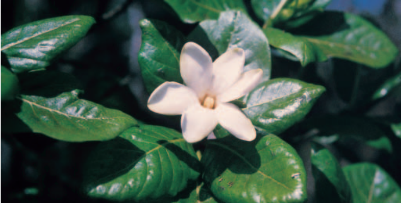
Figure 6. Hawaiian gardenia ( Gardenia brighamii ).

especially with Lānaʻi sandalwood. During the past few drought years, however, rats have disappeared from the lower elevations on the preserve, and natural seedling recruitment of this species has increased.