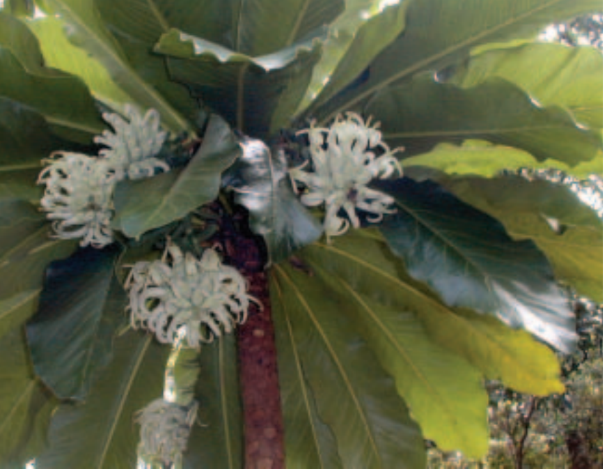
Figure 2. Cyanea superba (Cham.) Gray (Campanulaceae) growing on O'ahu.