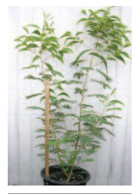
Figure 5. Grafted A. koa plant 6 mo after grafting onto A. mangium rootstock.

Nonnative sprouts possibly arising from the rootstock tissue is not an anticipated issue because the graft union was made below all meristematic tissues of the rootstock (that is, below the cotyledons).