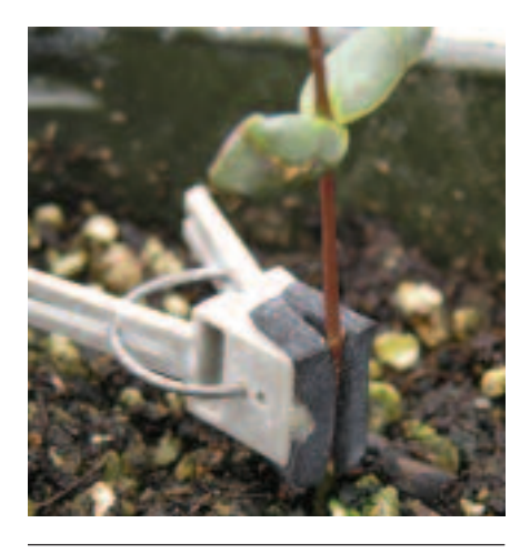
Figure 2. Grafting clips were needed for about 2 wk.

to be planted earlier and allowed to grow 2 mo longer than the A. koa seedlings to become large enough to match the stem size of A. koa scions of similar phenology. Acacia confusa seeds were planted at the same time A. koa seeds were planted because they grew and developed at similar rates. Cleft grafts were used primarily to join A. koa and A. mangium. Splice grafts were used primarily to join A. koa and A. confusa because the plants grow at similar rates as seedlings, the graft unions heal rapidly, and the splice grafts were quicker to perform. Grafted seedlings were placed in humid chambers at room temperature for 1 wk before grafting clips were removed. Plants were transferred to the 60% shadehouse 2 wk later for further growth and development.