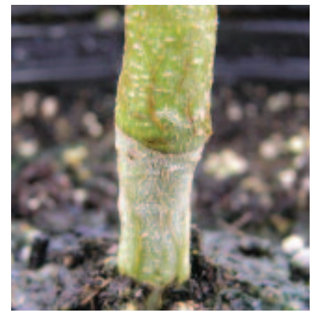
Figure 4. Cleft graft union 8 wk after joining scion ( A. koa ) and rootstock ( A. mangium ).

The margin of error is very small when grafting Acacia seedlings at this stage of growth, because the narrow stem diameters require very precise alignment of the scion and rootstock, and the young stem tissues are easily damaged. Although grafting was possible, a relatively high percentage of failed grafts occurred when grafting A. koa onto A. mangium seedlings. Further grafting practice, as well as determining optimum conditions for holding the plants while the grafts heal, may improve the percentage of successful grafts. But the difficulty we experienced grafting A. koa onto A. mangium