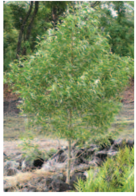
Figure 6. A 13-mo-old A. koa grafted onto a A. mangium.

We have immediate plans to test the A. mangium and A. confusa rootstocks against the fungal pathogens in the koa wilt complex and against root-knot nematodes. We intend also to examine the performance of grafted plants transplanted into forests or landscapes to evaulate the long-term compatibility of the graft union and the vigor of the plants.