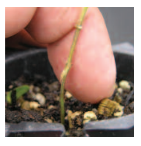
Figure 3. Splice graft, 3 wk after joining scion ( A. koa ) with rootstock ( A. confusa ).

Grafting success rates achieved in our first trials varied among species. The success rate was approximately 70% for A. koa to A. koa grafts and for A. koa to A. confusa grafts. The success rate was 20% to 25% for A. koa to A. mangium grafts. The grafting process was very simple and fairly rapid; a pair of seedlings could be joined and clipped together at a rate of 2 to 3 min initially and then at 1 min or less after practice. Graft unions