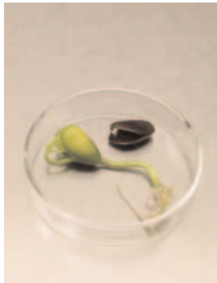
Figure 2. A Canavalia napaliensis seedling about 2 wk after treatment.