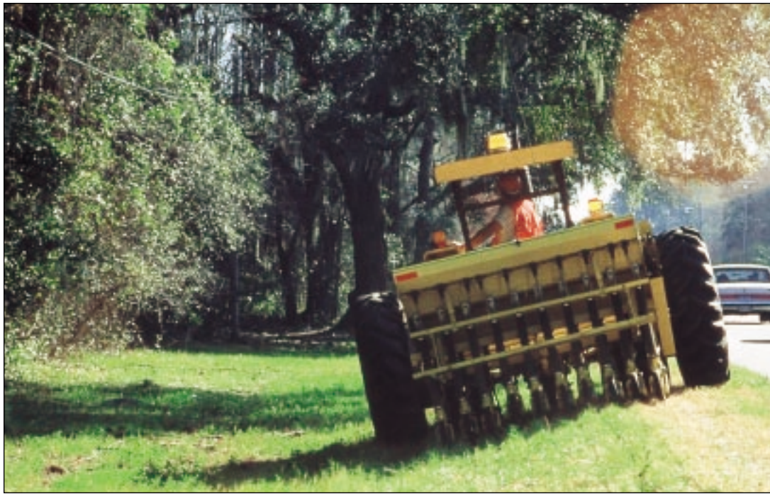
Figure 2 • The Florida Department of Transportation drilling wildflower seeds along a highway.