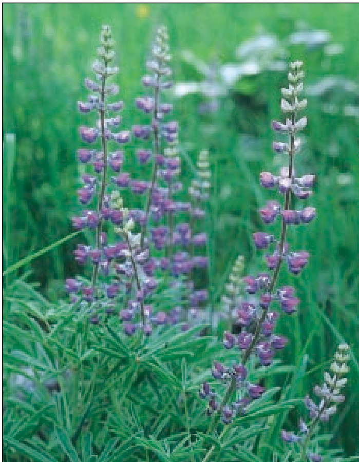
Silky lupinje (Lupinus sericus Pursh [Fabaceae]).