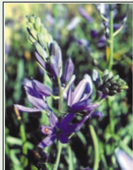
Greater Camas, Camassia leichtlinii